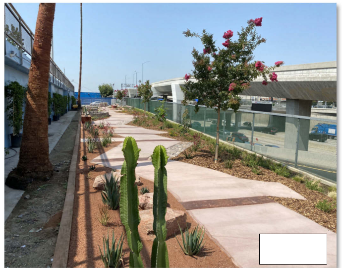
110/28 th Street, Los Angeles