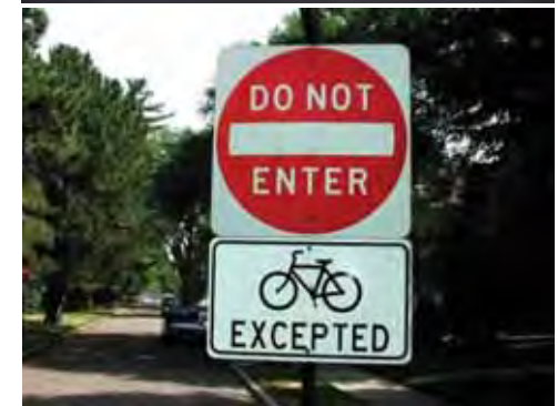
From top: Existing Adams Street Cross Section; Sample DO NOT ENTER – BIKES EXCEPTED signage