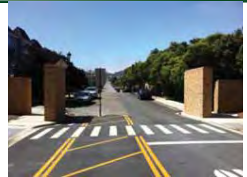
Partial closure on 15 th Avenue, north of Lake Street, San Francisco, California