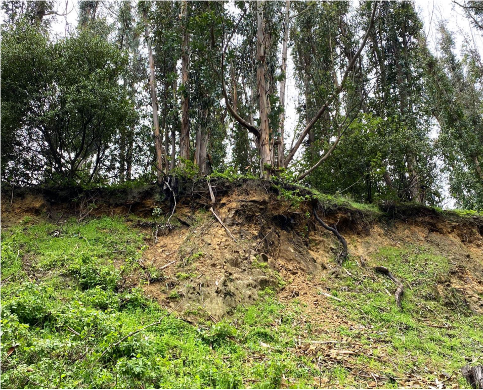
3 Taft Street - Erosion and exposed Root all