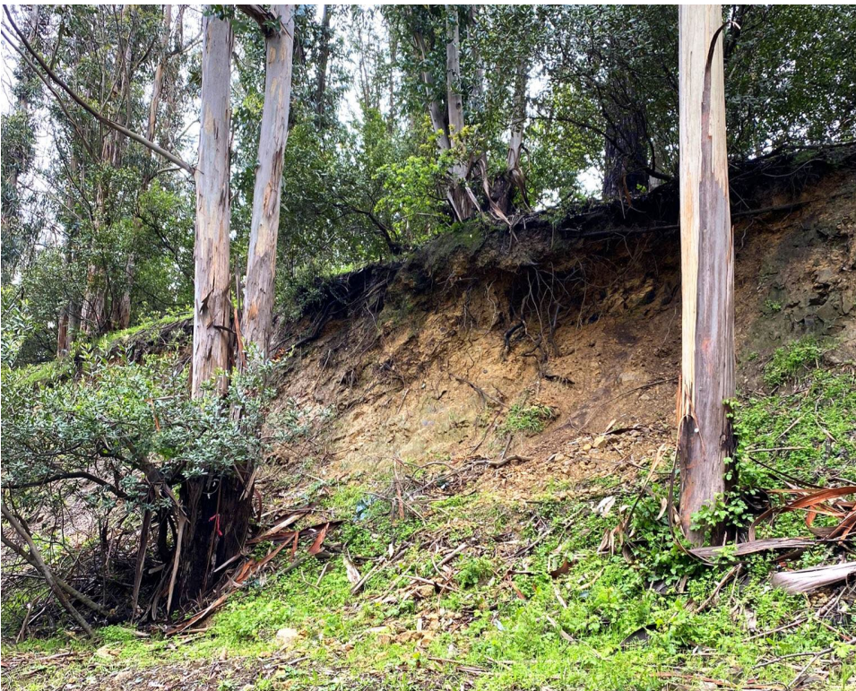
2 Taft Street - Erosion and exposed root ball