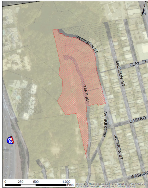
1. Map of project area

The proposed plan includes three primary elements. The implementation of the plan will be undertaken in phases by contractors selected and managed by the City of Albany.