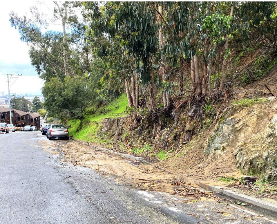
4 Taft Street - Erosion