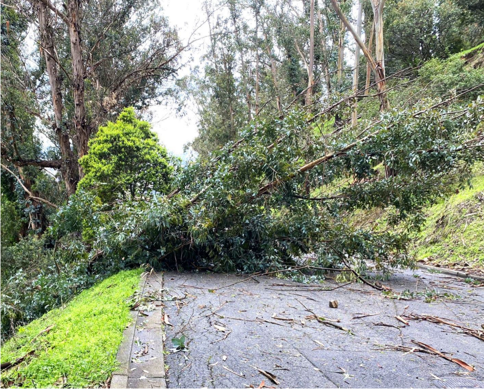
1 Taft Street - Tree Down on Public Street