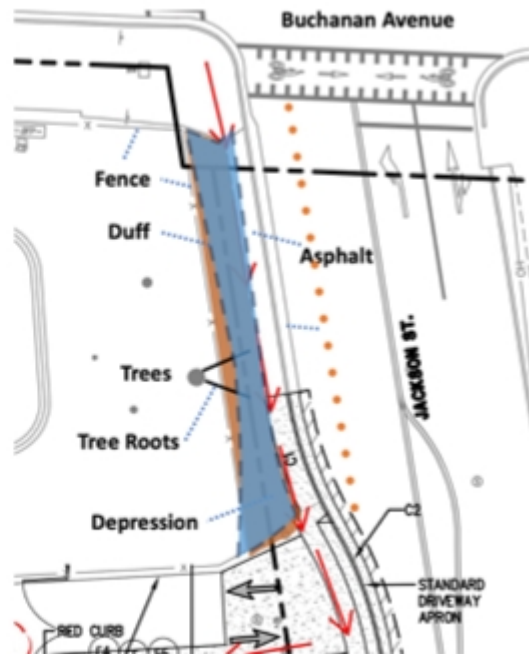
Photo of Location -

Area of removal, fill and grading shown in blue: